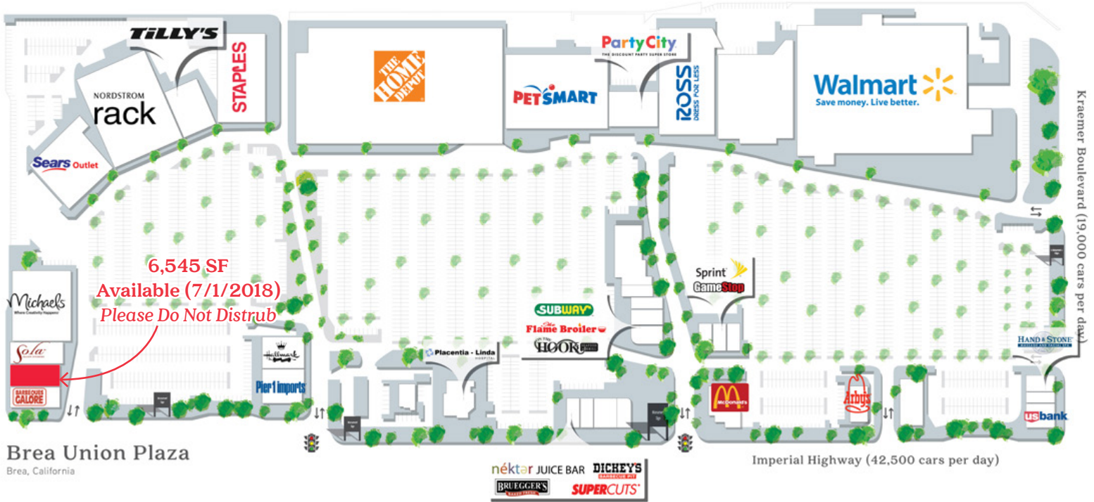
Brea Union Plaza Brea, California